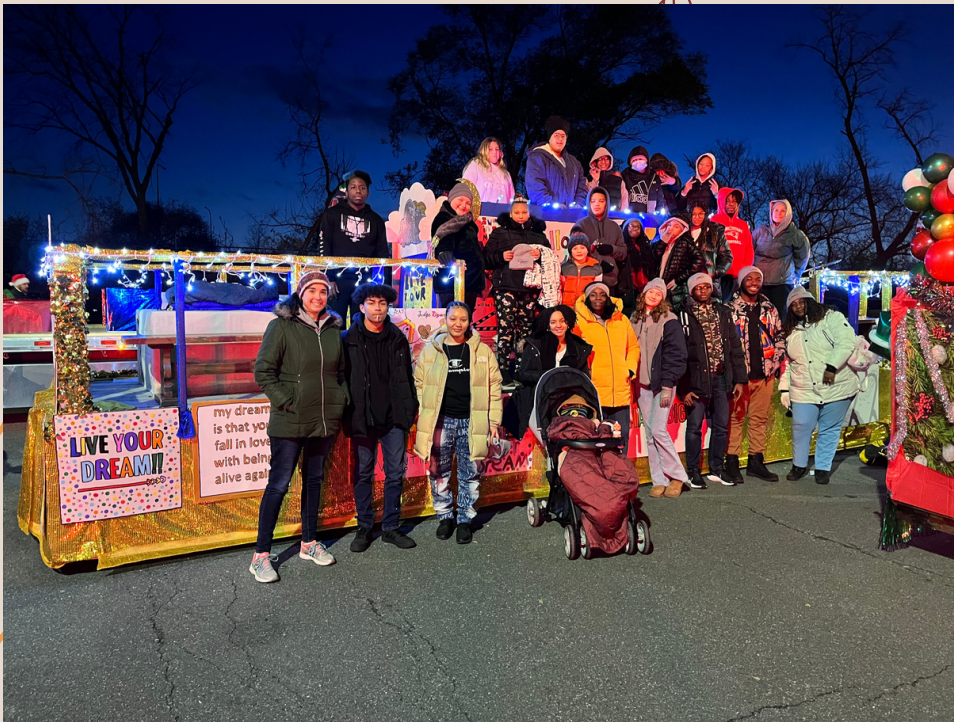
Schenectady Holiday Parade 11/19