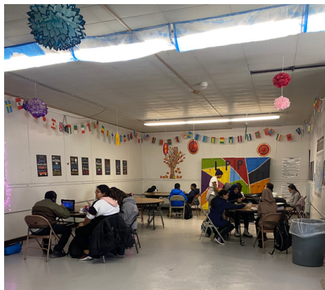
Lunch Program at Mont Pleasant Middle School!